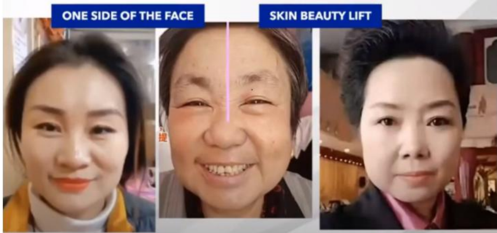
Note water retention on the untreated side of face