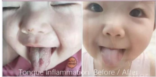
Lupus: Changes within 2 days